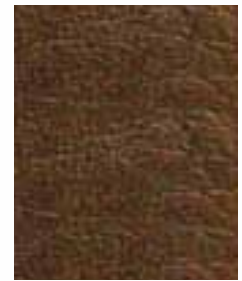
Coordinated Cover Mocha

Hot tub, cabinet and cover colors may not be exactly as shown due to printing.