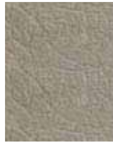
Coordinated Cover Steel