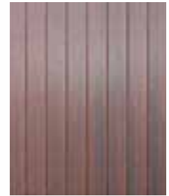
Everlast Cabinet Espresso