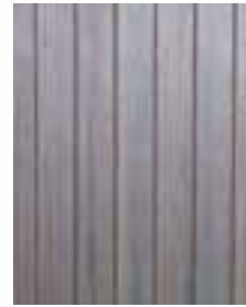
Everlast Cabinet Driftwood