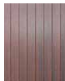
Everlast Cabinet Espresso