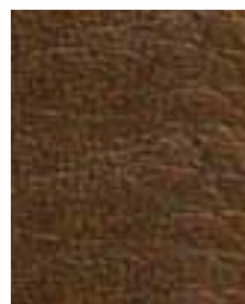
Coordinated Cover Mocha

Hot tub, cabinet and cover colors may not be exactly as shown due to printing.